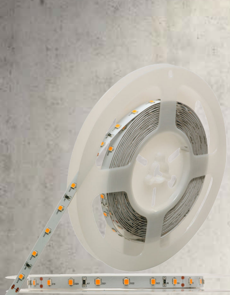
16123T (3000K) 16124T (4000K)