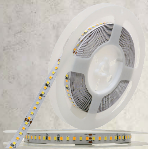
16117T (CCT Variable)