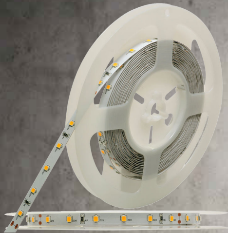
16113T (3000K) 16114T (4000K)